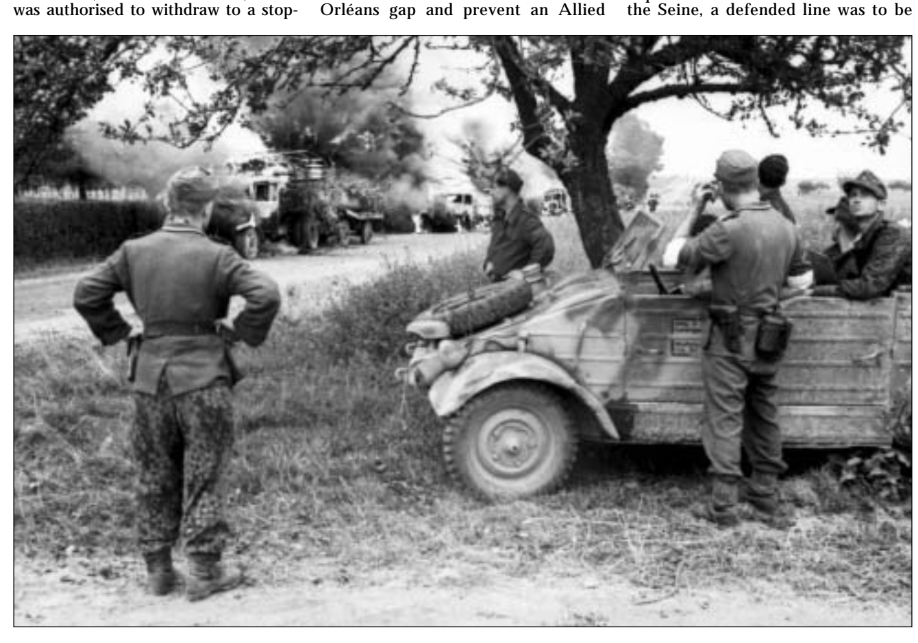
'When the aircraft attacked, some of the drivers had been fortunate enough to quickly leave the road to get under cover. This Kübelwagen belongs to the army — see the WH (Wehrmacht Heer) registration plate on the following page — but the man standing on the left and the one on the right looking at the sky belong to the Waffen-SS. I think that Genzler took this sequence about August 21-22. In a book published in France in December 2003, the author claimed to have found where this

advance toward Dijon. The Seine line was to be held right across Paris and 'if necessary, the battle in and about Paris will be fought without regard to the destruction of the city'. Should it prove impossible to make a stand in front of the Seine, a defended line was to be